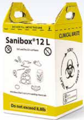
SANIBOX 12 L