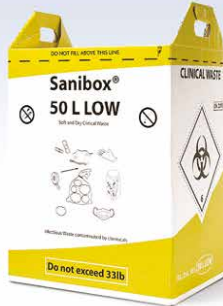
SANIBOX 50 L LOW