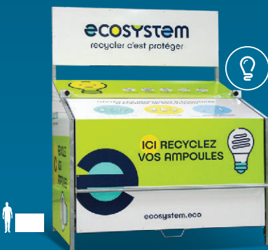
RECYCLING CENTER SHED (SMALL MODEL)