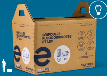
TUBES & LAMPS

ALL OUR RANGE OF PRODUCTS ARE COPYRIGHTED