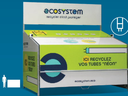
RECYCLING CENTER SHED (LARGE MODEL)

ALL OUR RANGE OF PRODUCTS ARE COPYRIGHTED