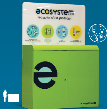
METALLIC CONTAINER FOR LARGE RETAILERS

RECYCLING STATION EXAMPLES We are a complete service provider, offering expert advice and know-how in all environmental and safety domains.