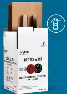
FIRE EXTINGUISHERS, AEROSOLS