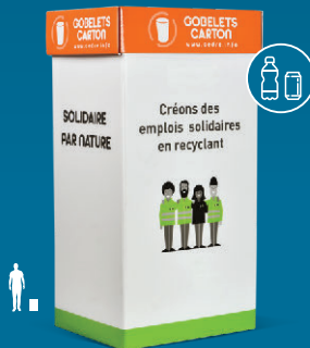
OTHER WASTE : CUPS/CANS/ TONERS/BOTTLES...