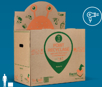
SMALL ELECTRICAL APPLIANCES

WEEE PACKAGING EXAMPLES Electronic materials • Light bulbs • Fluorescent lamps • batteries